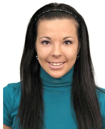
PHOTO - additionally attach a file to the letter in a format JPG, according to the sample.

PASSPORT* - additionally attach a passport scan to the letter.